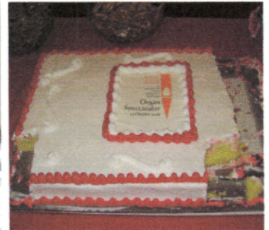
Organ Spectacular cake