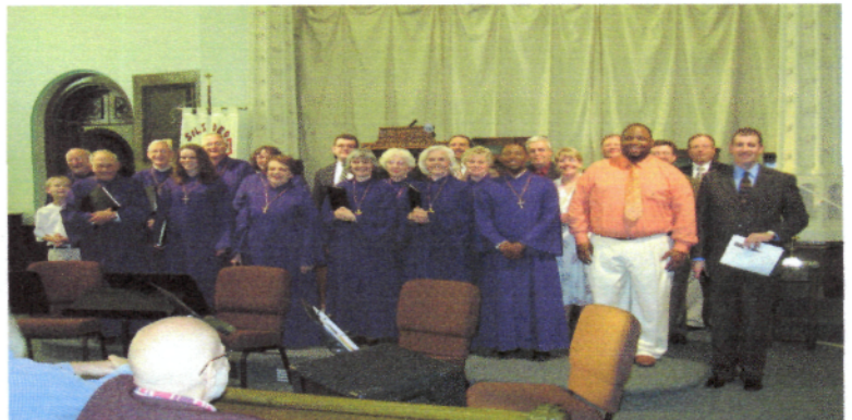
Organ Spectacular participants. First Presbyterian Church of York